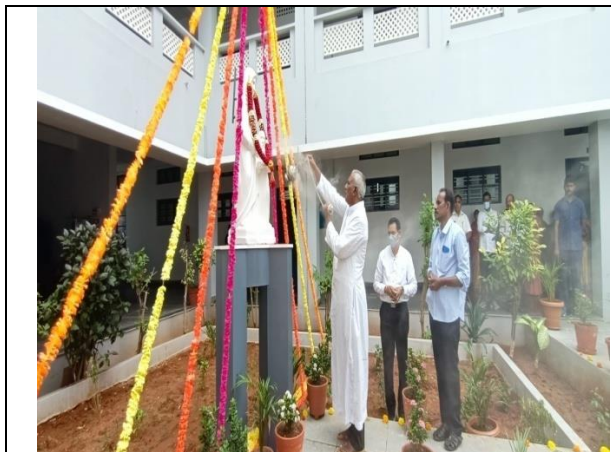
Veneration at the statue of our Patron Saint Anne

In commemoration of Birthday of Saint Anne our Patron, St. Ann's Feast day was celebrated.