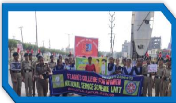
Rally on Aids Day Aids Day Awareness Programme