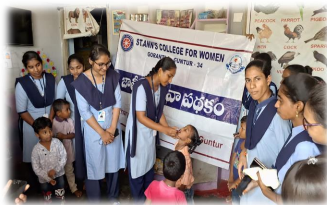
PULSE POLIO AWARENESS